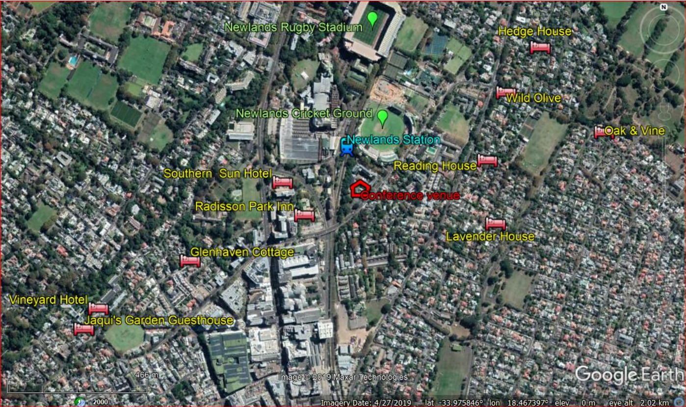
All options are within 1200 metres from the conference venue, The Cape Town Athenaeum